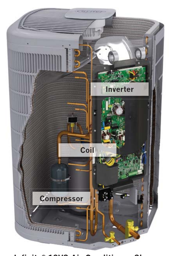
Infinity® 19VS Air Conditioner Shown